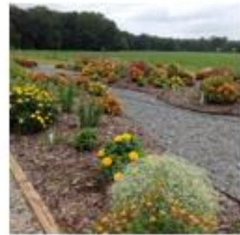
ECA garden at Extension Office