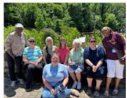
Rutherford County members tour the Flowering Bridge