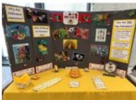
West District Display