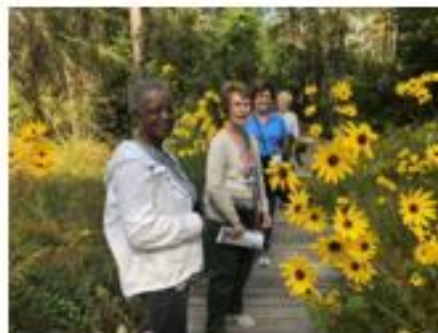
Randolph County members tour The NC Botanical Gardens