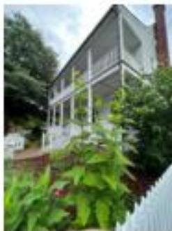
Tour of garden at Tryon Palace/Jones House