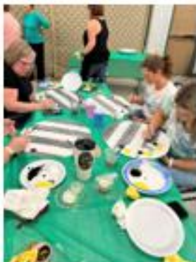
Rutherford County members paint Bee Door hangers and sampled pollinator inspired recipes