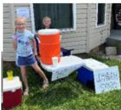
Perry Co. 4-H kids collecting & Elementary Class

Illinois is continuing the project to the end of 2023. At the 2023 IAHCE Conference we collected the donations counties have collected so far. IAHCE had collected $2,508.96 so far and when the call came in from NVON to hurry and get the donations sent in to be matched by Heifer International we were very excited to do so. The goal was to have all of our members give at $1.00. We have approximately 4,100 members so with the match we have far exceeded donation expectations!!!”