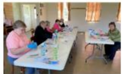
Cleveland County members presented several programs, including • Earth Dumplings – Seed Bombs • 7 Things You can do for Pollinators