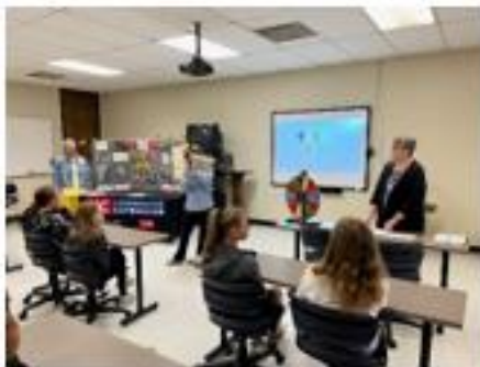
Rutherford County ECA Presentation for 6 th graders at STEM Expo