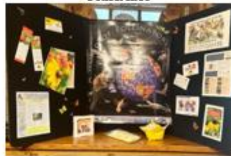
Pollinator display at State Conference