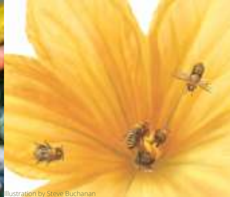
Illustration by Steve Buchanan