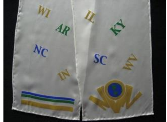
54" x 8", one size fits all

This NVON Scarf is 100% silk, custom designed and very limited in supply. Each scarf has the official NVON logo and abbreviation for each of the 8 NVON member states. Purchase one for yourself, for your special NVON friend or give as a gift for members of your club, family and friends. Let's make NVON one of the most recognizable logos up there with Coca Cola and McDonalds. An organization made for America.