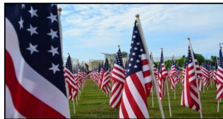
Photo: 2015 Field of Honor