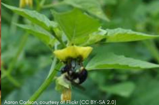
Aaron Carlson, courtesy of Flickr (CC BY-SA 2.0)