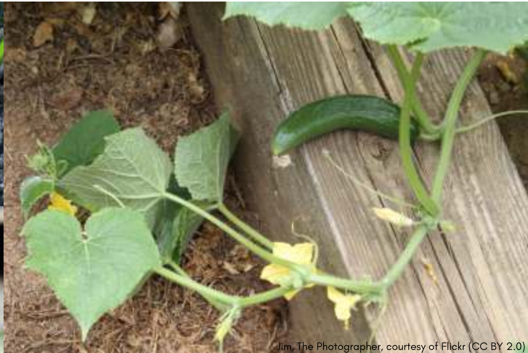
Jim, The Photographer, courtesy of Flickr (CC BY 2.0)