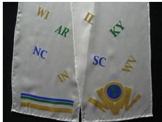
54" x 8", one size fits all

This NVON Scarf is 100% silk, custom designed and very limited in supply. Each scarf has the official NVON logo and abbreviation for each of the 8 NVON member states. Purchase one for yourself, for your special NVON friend or give as a gift for members of your club, family and friends. Let's make NVON one of the most recognizable logos up there with Coca Cola and McDonalds. An organization made for America.