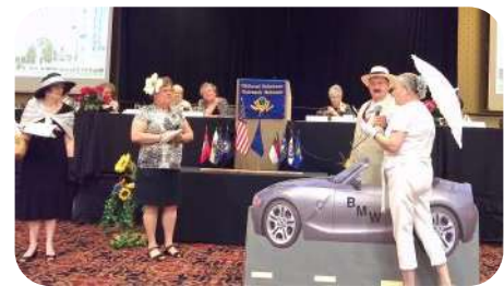
South Carolina's invitation for 2020!