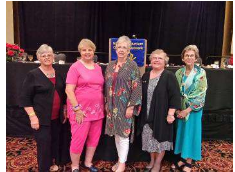
NVON Executive Board