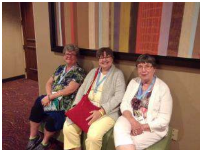
Taking a break!