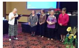
Incoming officers being installed