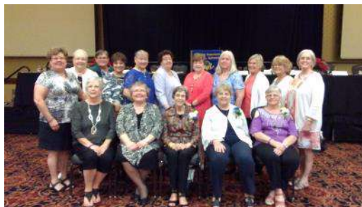
NVON Board & Appointed