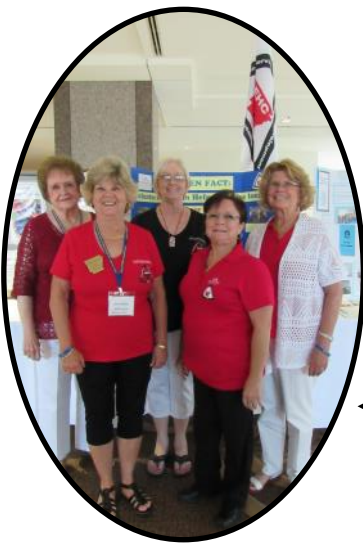
← ARKANSAS ILLINOIS INDIANA →