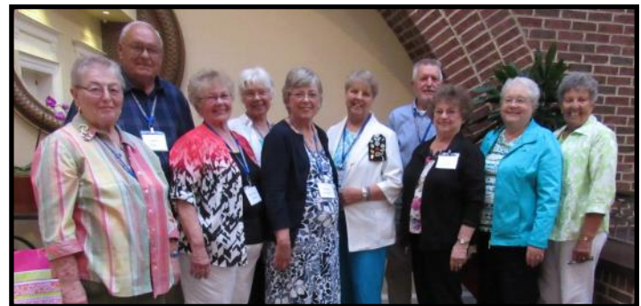
WISCONSIN ↑ ↓ SOUTH CAROLINA