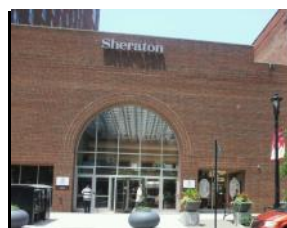
Sheraton Raleigh Hotel