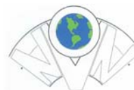
National Volunteer Outreach Network

Encourage friends and other members of your state organization to become individual members of NVON.