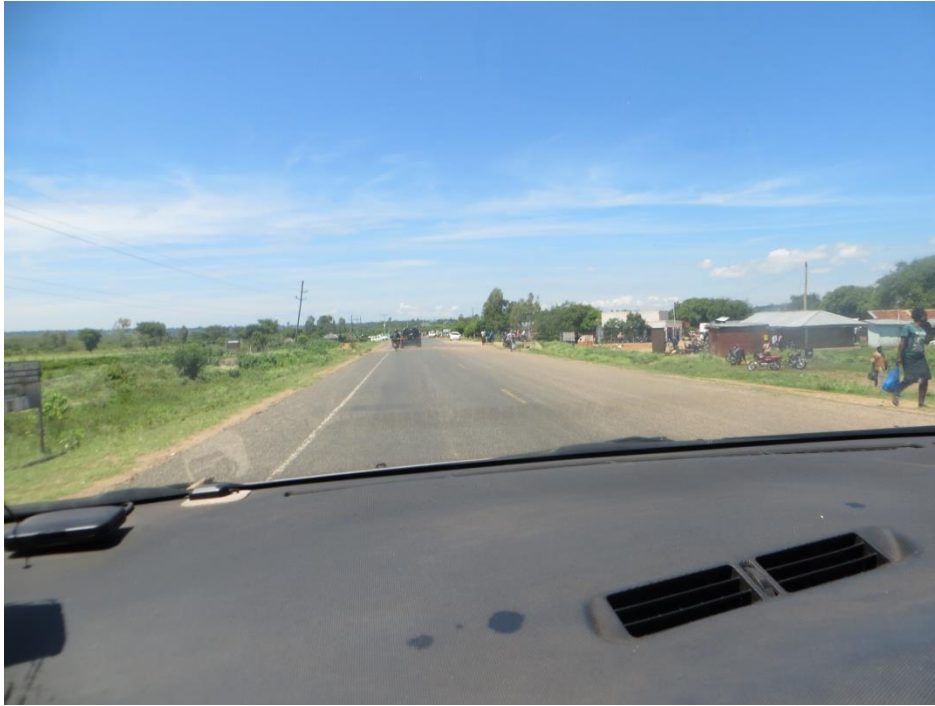
On the way to do a distribution in a village