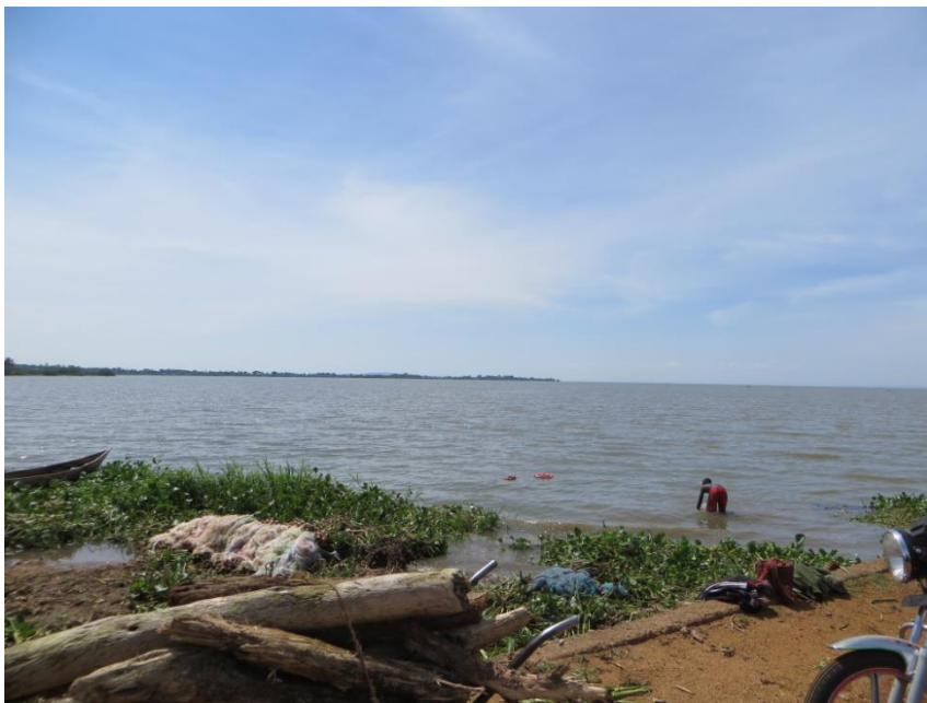
Villagers here drink the water directly from the Lake. See the lady in red fetching the water. Cholera outbreak is constantly experienced here.