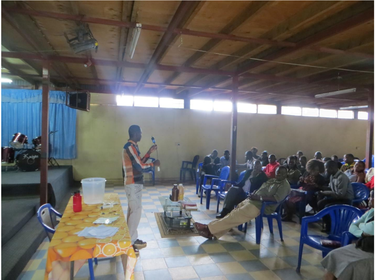
In a church doing the training before the distribution of the filters.