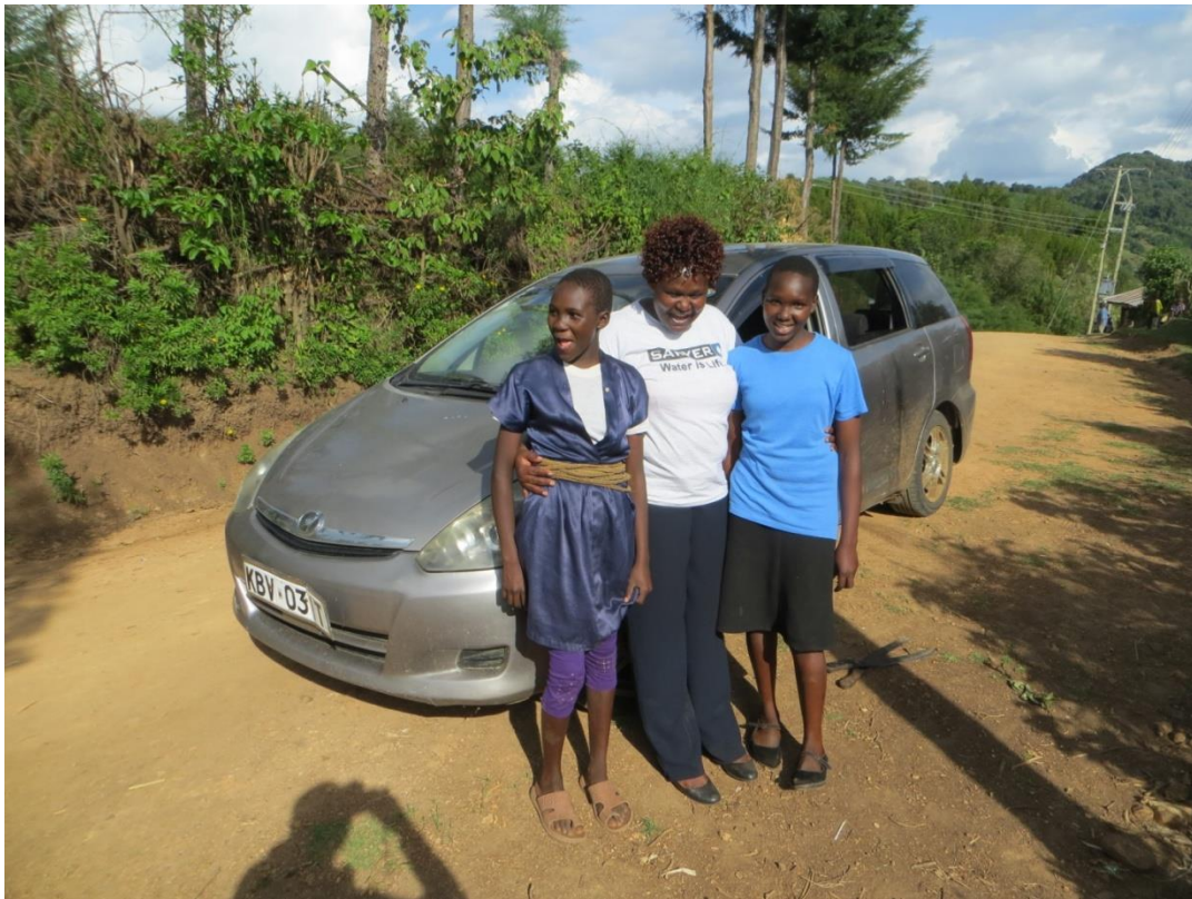
Future Kenyan Ministers....on their way to fetch firewood...Look at the pangas and the rope cum belt...beautiful