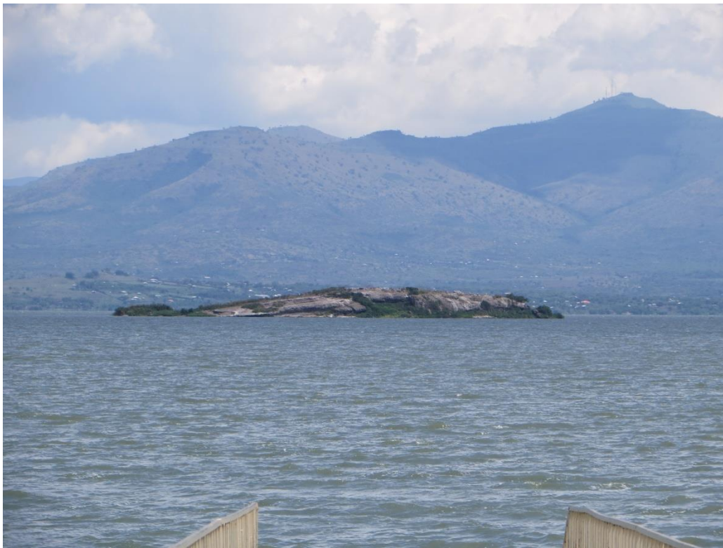
We had to cross the water to get to the people on the other side.