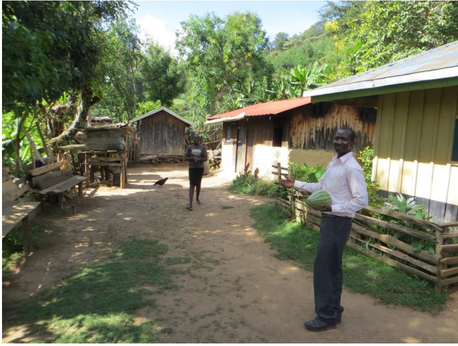
Some refreshment is offered.....water melon.....